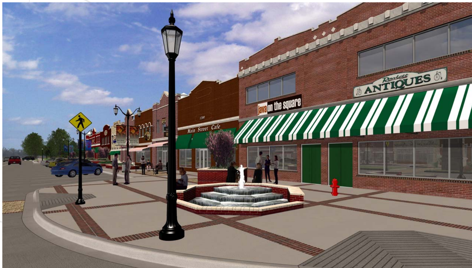
Town Square from Commerce Street