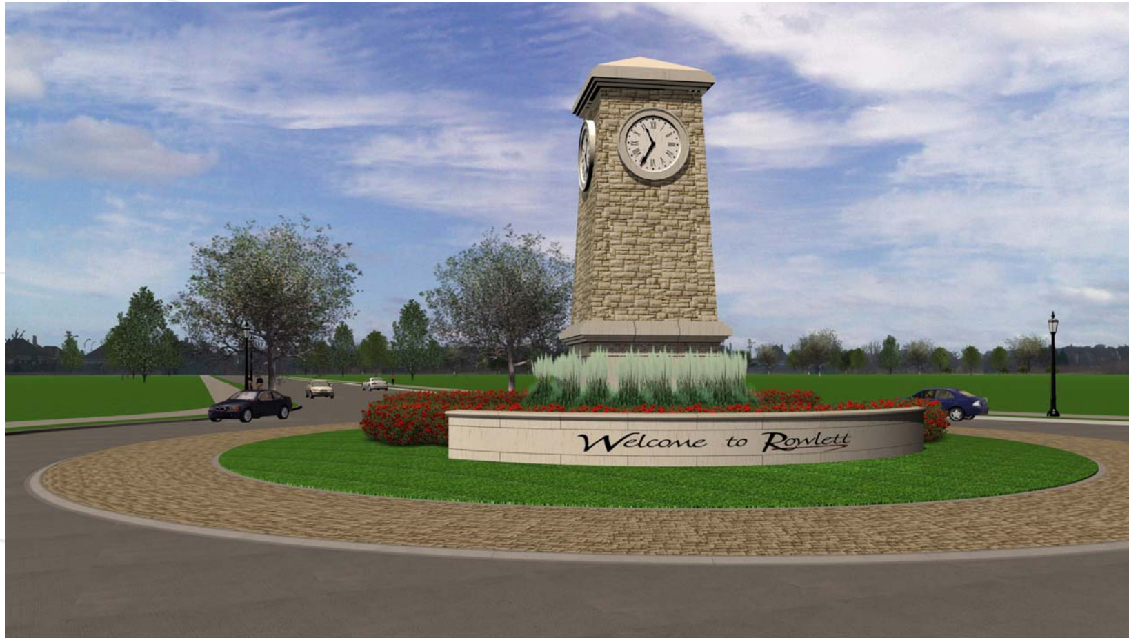
Eastern gateway at roundabout