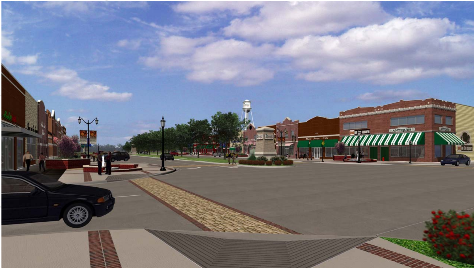
Town Square from Commerce Street