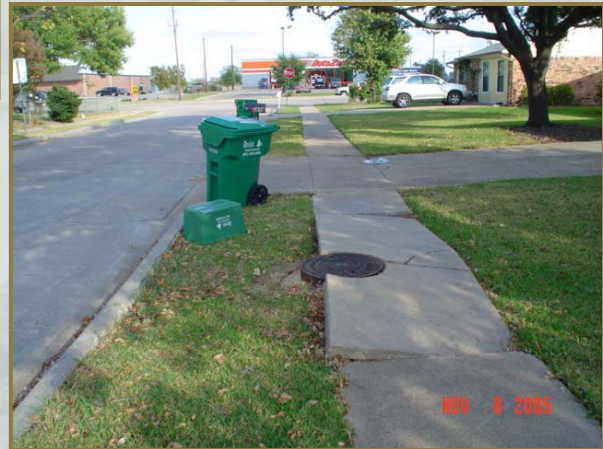
Cedar Drive Sidewalk